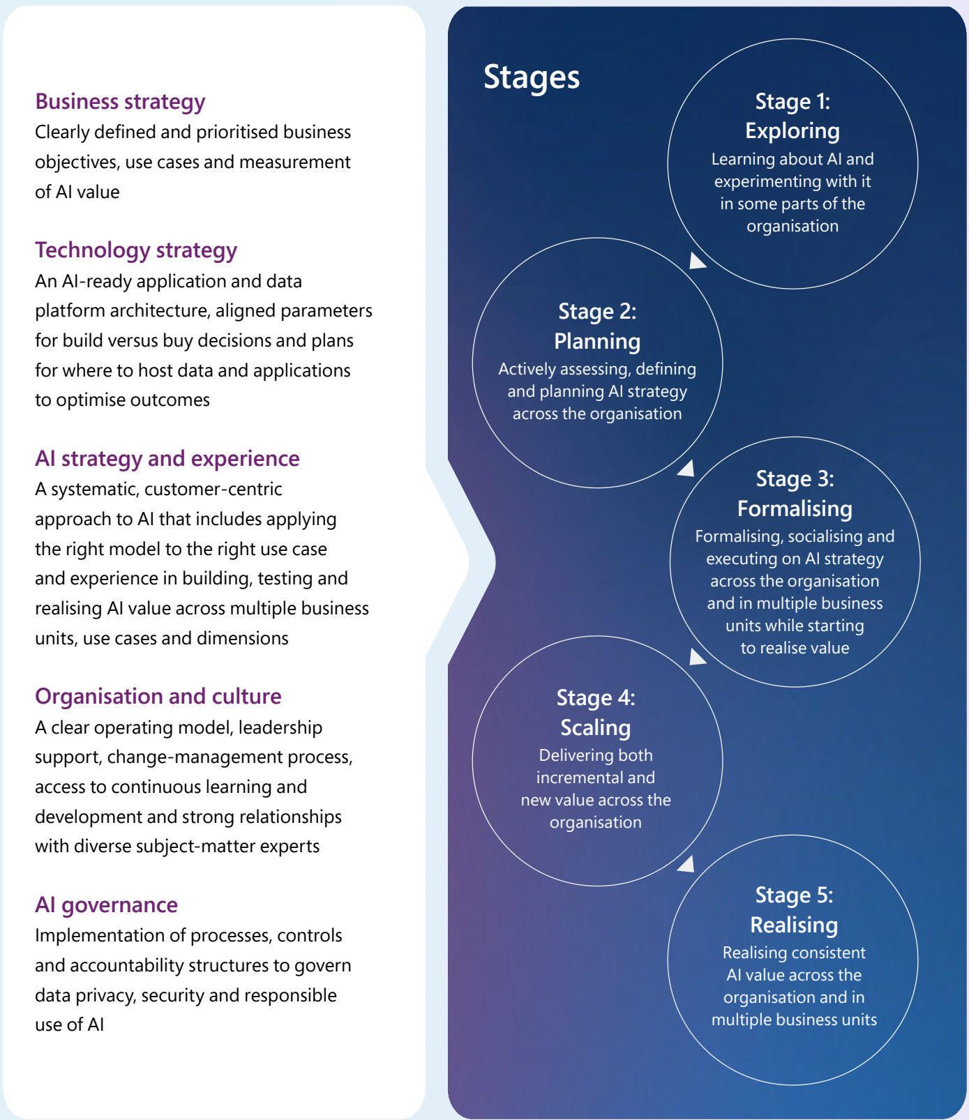
Figure 1: Five Pillars of AI Success